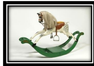
A rocking horse

Victorians loved mechanical and 'surprise' toys, like this one